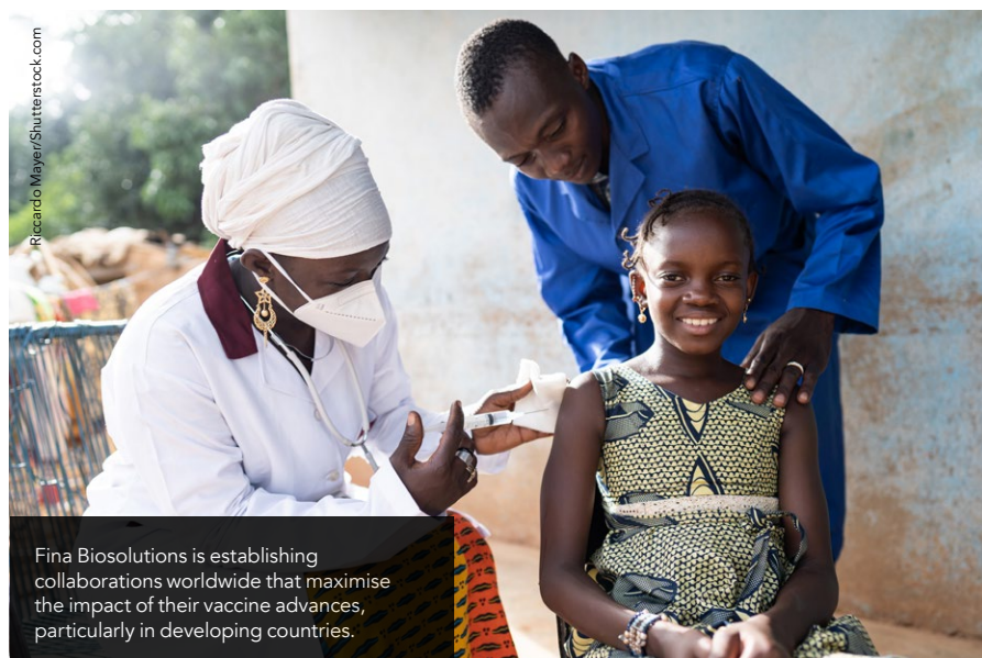
Fina Biosolutions is establishing collaborations worldwide that maximise the impact of their vaccine advances, particularly in developing countries.